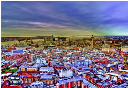
Eric The Fish